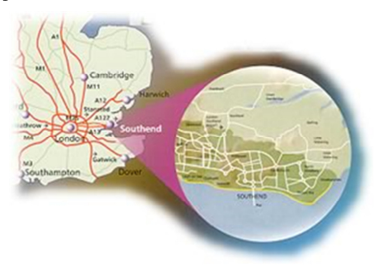
Figure 2.1: Southend-on-Sea's location

2.13 Southend-on-Sea is a densely populated urban area covering 4,175 hectares (ha), which equates to almost 42 residents per ha. Its density is high compared with other unitary authorities such as Thurrock and Brighton (10 and 31 residents per ha respectively). The most densely populated parts of the Borough fall within the districts of Leigh and Westcliff and to the east of central Southend where densities can be as high as 145 residents per ha. This is shown in Figure 2.2.